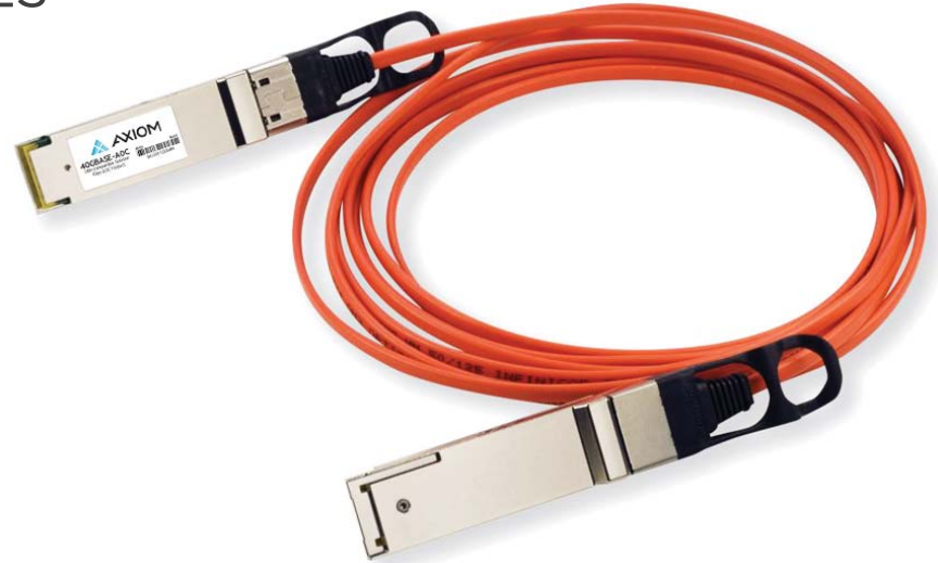
AOC - SFP+, QSFP+, and 100Gb QSFP28

Axiom's Active Optic Cables (AOC) achieve high data rates over long reaches. Using a fraction of the power and significantly lowering your costs, Axiom's AOC streamlines installation for high-performance computing and storage applications.