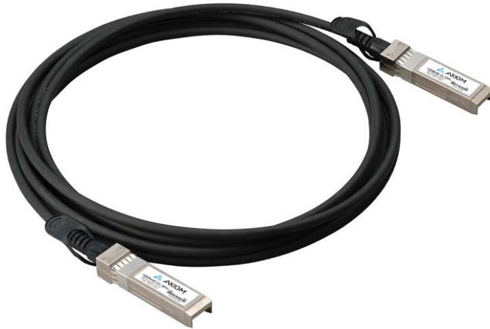
DAC - SFP28, SFP+, QSFP+, and 100Gb QSFP28